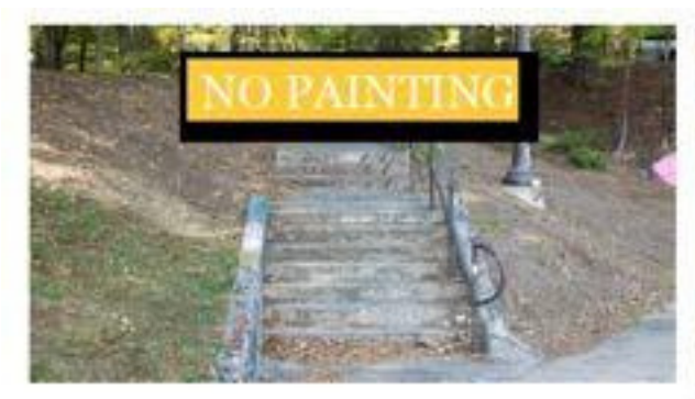
The steps and handrails from Campus Drive to Pettigrew Street (see above)