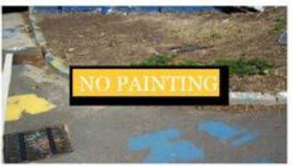
Any handrails, roadways, or sidewalks, even if located inside of the tunnel (see above)

Students or student groups who violate these expectations will be held accountable through the university's disciplinary processes and may also be subject to criminal charges. Note that that defacement of any public property (i.e., property not owned by Duke) is a violation of North Carolina law.