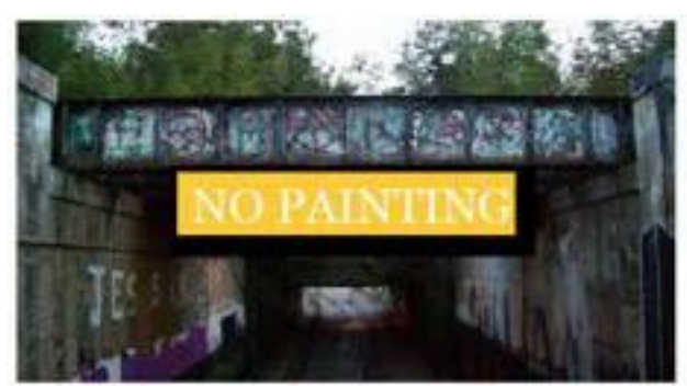
The Main Street Bridge and the railroad trestle (see above)

Painting is permitted on the outer edge of the Pettigrew Bridge facing Campus Drive and the exterior (inner) face of the concrete Campus Drive tunnel walls.