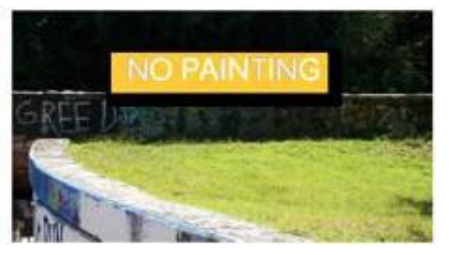
The Duke stone walls (see above)