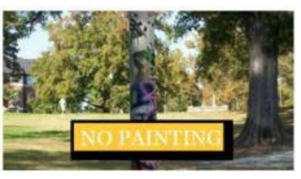
On any light poles, signs or signposts (see above)