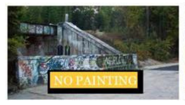
The Pettigrew Street Bridge (side of the bridge on Pettigrew Street not overlooking Campus Drive (see above)